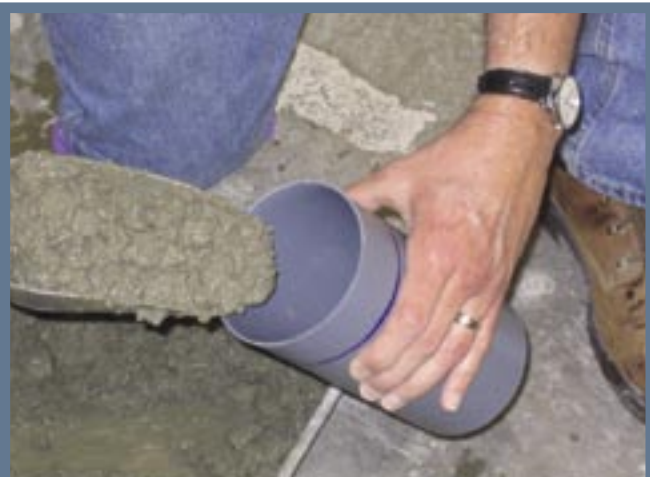
Put some fresh concrete in a container