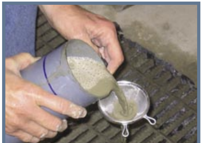
Pour the liquid portion over the screen