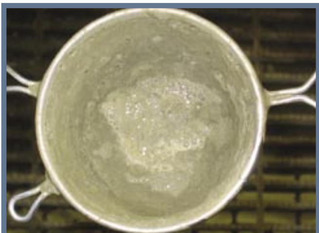
A visible fibrous mat will form