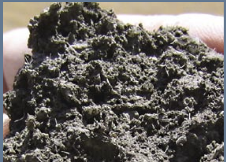
The very small UltraFiber 500® fibers can be seen protruding across the broken edge