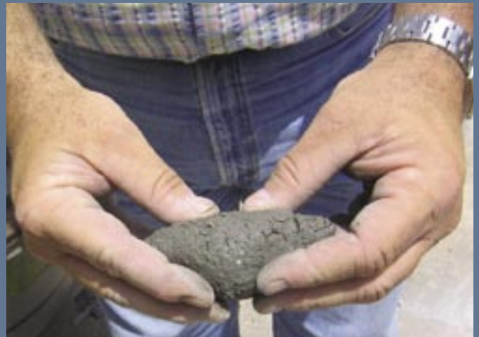
Break the pieces open