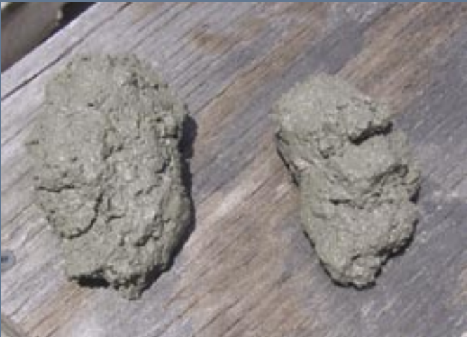
Allow some concrete pieces to partially dry

Method A: This method requires no tools or materials to perform. As the concrete is being poured and placed, pick up a small handful that has been screeded off the form edges or dropped on the ground at the site. Let this concrete dry for about 15 to 45 minutes (time required is dependant on weather conditions and mix type). As it dries and begins to harden, the water is being drained from the fiber due to the aggressive hydration reactions. The water draining from the fiber causes the fiber to become less flexible and more rigid. Once the concrete piece is adequately hardened, break it open and numerous tiny fibers will be visibly protruding from the broken surface confirming the presence of UltraFiber 500® in the mix. Heating the small concrete sample can speed the time required for it to dry adequately (for example: placing it in direct sunlight, putting the sample near a hot vehicle exhaust, laying it across hot air from vehicle defroster vents, etc.).