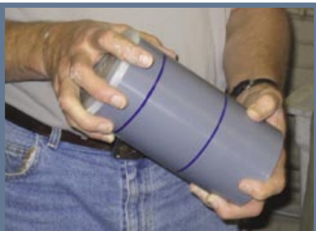
Cap the container, shake for 20 seconds