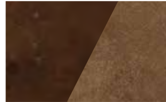
DEEP WALNUT DSL-4010