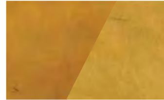
RAW SIENNA DSL-2210