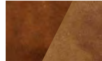
CHOCOLATE BROWN, DSL-3510