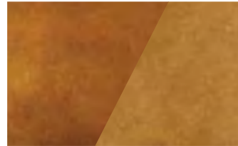
SADDLE BROWN DSL-3710