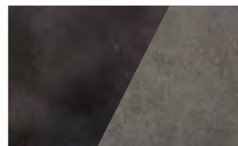
PATRIOT BLUE DSL-5510