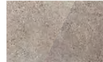
DEEP WALNUT DSL-4010