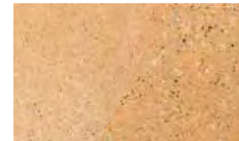
BURNT SIENNA DSL-4210