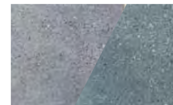
PATRIOT BLUE DSL-5510