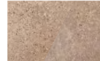
CHOCOLATE BROWN, DSL-3510