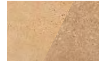
SADDLE BROWN DSL-3710