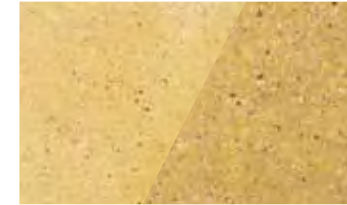
RAW SIENNA DSL-2210