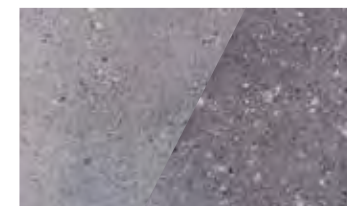
MIDNIGHT BLACK DSL-7010