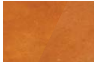
TERRA COTTA DSL-3010