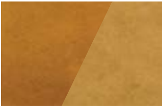
DEEP CARAMEL DSL-2510