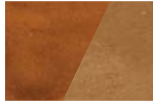
MISSION BROWN DSL-710