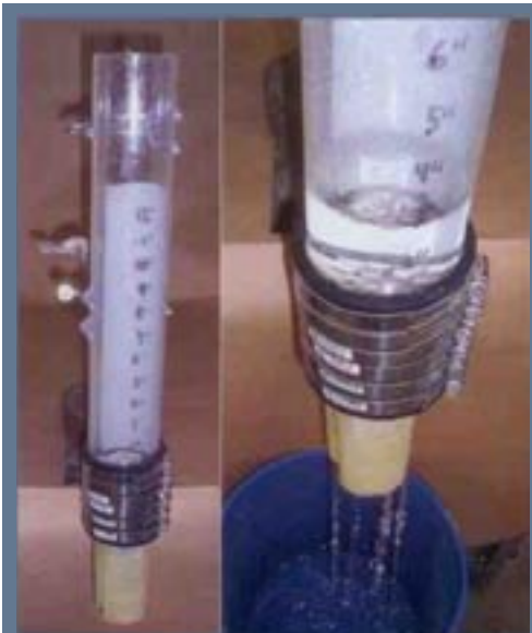
Pervious Concrete Permeameter